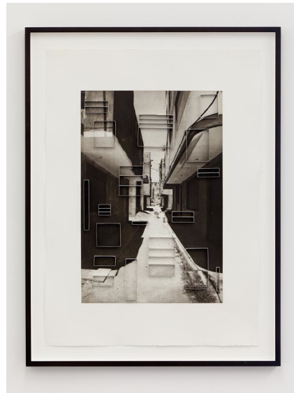
Ishmael Randall Weeks, "Cutout perspective 1." 2012. Photogravure print and cut paper, archival adhesive. 31 x 22 1/4".

You know, as in you're given a reference point through the two source films that I used, which talk about a 30 year or 40 year difference in ideological thinking or mentality or construction. I don't believe in it, because I think they're very different and I think that concept comes from a very Western perspective on the third world.