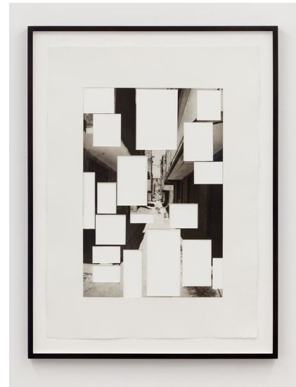
Ishmael Randall Weeks, "Cutout perspective 2," 2012. Photogravure print with cut-out mounted on paper, 31 × 21.25". Courtesy of the artist and Eleven Rivington.

Rail: You made a lot of these small works—the black-and-white architectural images incised with linear, architectonic cuts—and that seems to be the place where your relationship to an open investigation of the political is most clear. I don't want to read that work too literally, but I am thinking here of the way in which most of these images picture a building or site in the process of being built. They're also not canonical buildings, or by well-known architects, as was true of some of your work in the past.