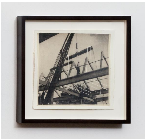
Ishmael Randall Weeks, "Vigas (Nuevo Mundo S.)," 2012. Acrylic and photo transfer drawing with cut-out mounted on paper, 7 1/8 × 7 1/4".

Rail: Exactly. It seems to me that we see something similar going on with OWS, which was also an attempt to think about what the political is in our present moment. It was a very conscious decision not to create a system of demands and actions which would be coherent and unified and, for better or worse—and there's been a lot of debate, obviously, about OWS's efficacy. But nonetheless, for me, the most important fact is simply that something like OWS, which is to say that kind of open, questioning relation to the political, took off like wildfire, at least for a minute, and we'll definitely be seeing the ramifications of that experiment in the coming years.